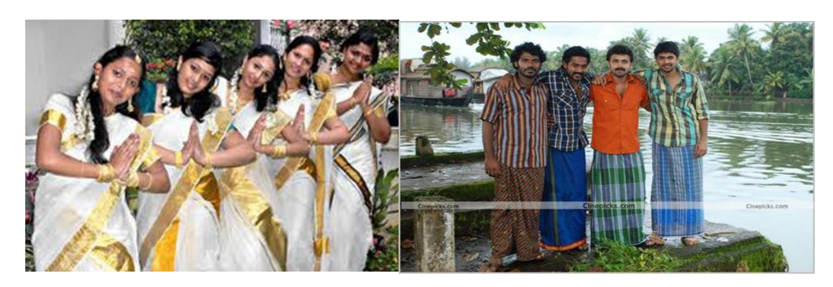
Women of Kerala in traditional attire

Malayalam (/malayALam/)- main language of of Kerala (South India) & the Lakshadweep Islands (Laccadives) (west coast of India). Malayalis (speakers of Malayalam) are almost totally literate. 4 % of the population of India speak Malayalam and 96% of the population of Kerala speak it (29.01 million in 1991). Malayalam ranks 8 among the 15 major languages of India. The great majority of residents of Kerala are Malayalis, but there are many smaller ethnic groups including Tuluvas, Tamils, Kannadigas and Konkanis.