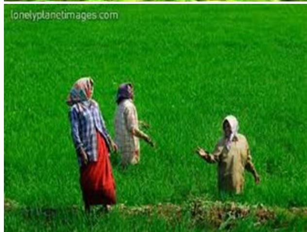
Women in rice fields in Kerala